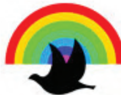
#4 Evidence of the Flood