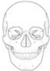
#1 Evolution A Critical Assessment